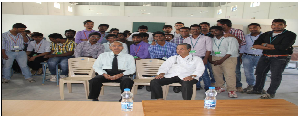
Blood Donors along with Director, Red Cross Team